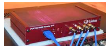
Customized front end with up to 8 RF cores and 8 RF inputs, OCXO