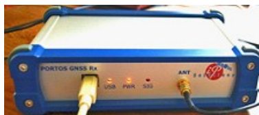
PORTOS: OCXO , four RF channels (one or more antenna inputs)