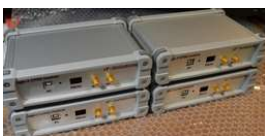
Academic Eagle: TCXO GPS L1 only . One or two RF channels, (one or two antenna inputs.)